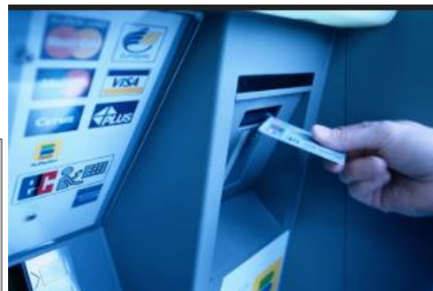
ATM and ATM card