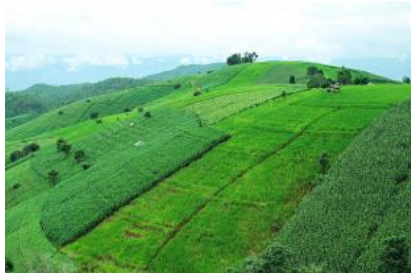
Farming on hills