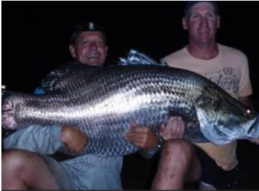
Nile perch from L. Victoria