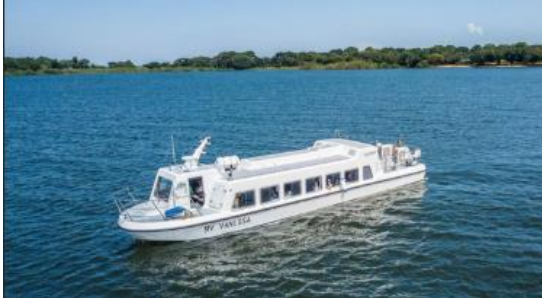
Boat on Lake Victoria